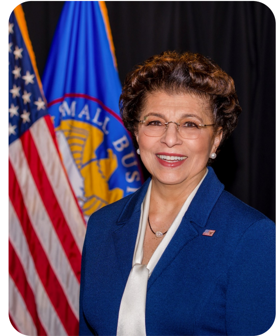
Administrator Jovita Carranza

Upon a request received from a state's or territory's Governor, SBA will issue under its own authority, as provide by the Coronavirus Preparedness and Response Supplement Appropriations Act that was recently signed by the President, an Economic Injury Disaster Loan declaration.